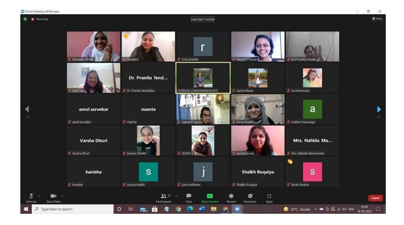
Activity 3: BEST BOOK ELECTIONS

A wonderful event was organised by the student council under the guidance of the faculty. Students volunteered to promote a book of their choice. The student with the most number